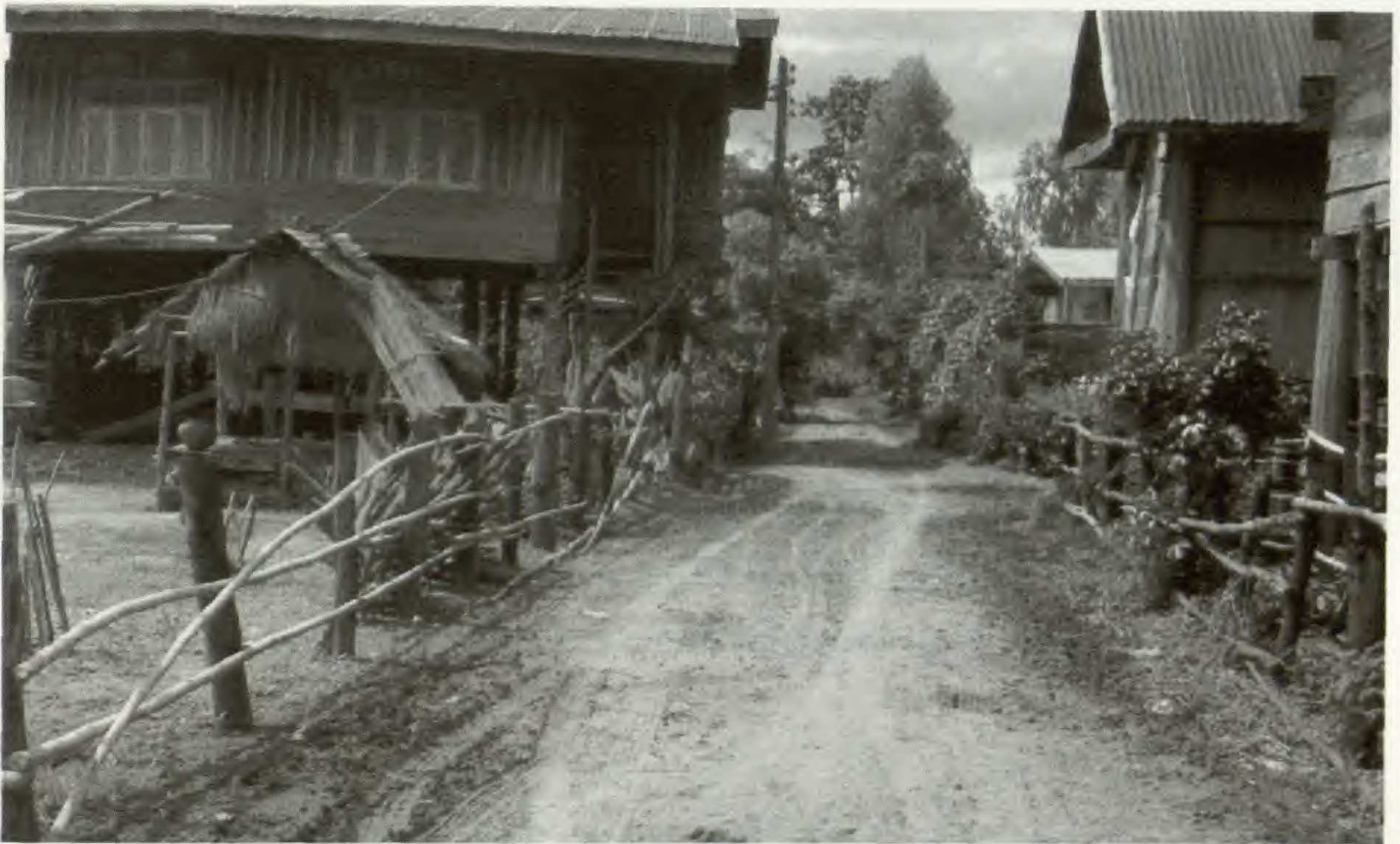
FIGURE 2.—A scene from the village showing houses and dirt road.

Life-ways are changing rapidly in Isan and villagers are being affected in terms of economics, social relationships and culture. At the local level, a growing influence of the nationalized central Thai image, an increase in development projects, and a rising monetization of the economy are beginning to influence the regional lifestyle in a variety of ways. Local resources, which used to dominate home use,